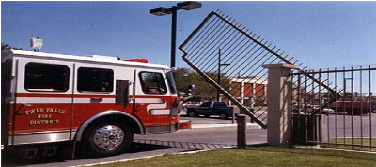
Example Of An Emergency Gate In Another Location

The one-way-in and one-way-out access to Four Hills Village will be preserved. Kevin Smith of the new JTH development stated that they are in favor of a new fire station in their neighborhood. They also want the gate to be used only in emergencies because they do not want cut-through traffic.